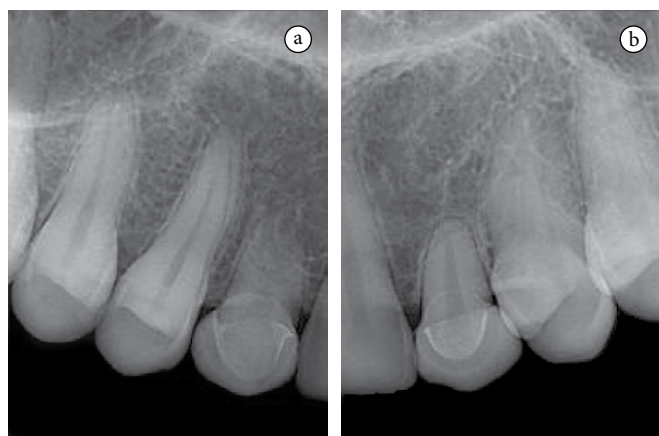
Figure 5. a-b) Final periapical radiographs.

Percentage is based on the average size for the permanent canine as equalling 100%. (Table adapted from Woelfel, Scheid 11 - "Dental Anatomy").