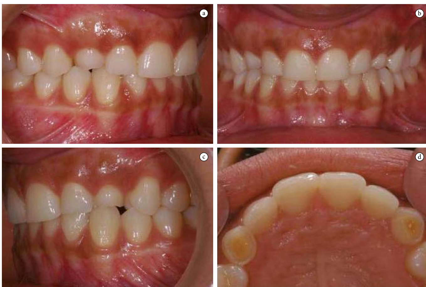
Figure 2. a-d) Initial intra-oral photographs.

that permanent canines are almost indispensable for an attractive smile and for functional occlusion 5 .