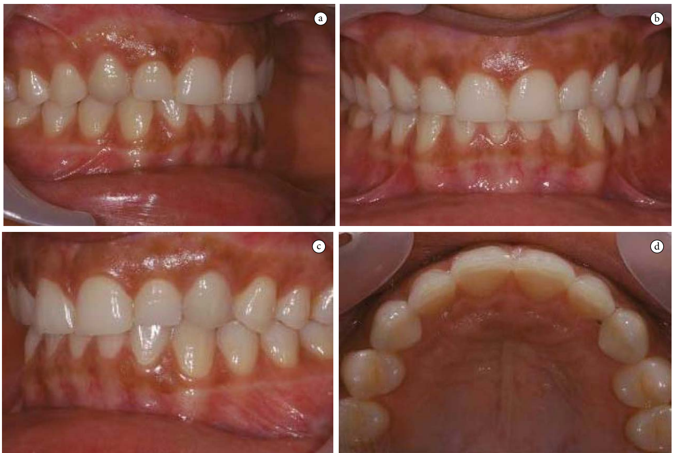
Figure 4. a-d) Clinical figures after treatment.