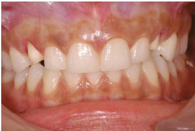
Figure 3. Teeth preparations.

Analyzing Table 1, it can be seen that the deciduous tooth has only 72% of the size of the permanent canine. In terms of mesio-distal dimensions, the values are very similar, ranging between 97% (crown) and 95% (cervix), which does not constitute a