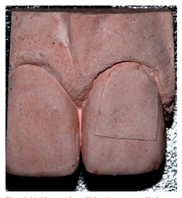
Figure 2. Model in special type IV dental stone cut into block.

Relative isolation was performed with cotton roles and a cheek retractor. The selected teeth were dried with compressed air and the first individualized strips of absorbent paper were inserted into the gingival sulcus to measure the amount of crevicular fluid prior to the displacement procedure. The paper strips were held in position for 60 seconds and placed in the respective receptacles. The displacement cords (Ultrapak sizes 000 and 1) were then positioned, as in the previous step, left for four minutes and removed. The teeth were dried with compressed air and the second individualized strips of absorbent paper were inserted into the gingival sulcus, held in position for 60 seconds and stored in the respective receptacles. The receptacles with the paper strips were weighed on a precision scale (Mettler Toledo, model XS205). The difference between the initial and final weight of each paper strip was determined, corresponding to the weight of the fluid expelled by the gingival sulcus and absorbed by the paper (Figure 4).