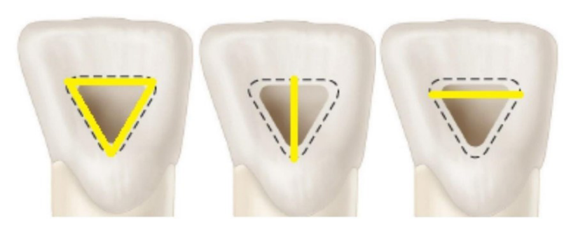
Figure 2. Identification scheme of the measurement of the area, height and width.

The teeth were photographed using a bench microscope (Alliance, São Paulo, SP), and the images were evaluated using the Adobe Photoshop 2020 software. To calibrate the Software, a ruler was used beside all the teeth in the photographing process, to define the actual scale. Then, the wear in the buccal/lingual direction (height), the mesio-distal wear (width), and the total area of wear on the structure of the tooth provided were evaluated (Figure 2). These data were compared using the Student t-test for paired samples (p<0.05). Only values outside the \overline{XX} \pm 2\sigma\chi\sigma\chi interval were considered outliers. Both analyses were performed using the Bioestat 5.3® software.