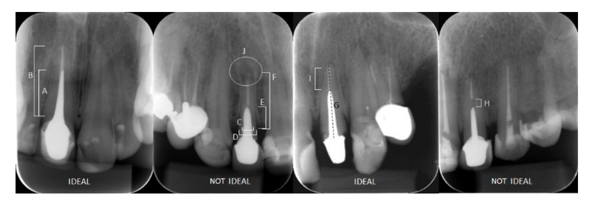
Figure 1. Measures obtained for each assessed tooth. A = 2/3 \times B (ideal post length); C = 1/3 \times D (ideal post diameter); E = 1/2 \times F (ideal post:bone crest ratio); G = post contiguous to root canal; H = presence of gap between the remaining root canal filling and post; I = ideal amount of remaining root canal filling: 4mm; J = absence of periapical lesion.

All radiographs containing endodontically treated teeth with cast metal posts and cores were expanded, and the measures were taken observing the absence or presence of failures according to the following prosthetic principles: length of post, diameter of post, ratio between post and bone crest, contiguity of post to root canal, gap between post and the remaining root canal filling, amount of remaining root canal filling, and absence of periapical lesion. The following prosthetic data were considered satisfactory: cast metal posts and cores with post length equal to 2/3 of root length (1mm error margin); post diameter equal to 1/3 of root diameter (0.5mm error margin); post:bone crest ratio with the post reaching 1/2 of root bony implantation; post contiguous to root canal with no deviations; absence of gap between post and the remaining root canal filling (0.2mm error margin); remaining root canal filling in the apical third of the tooth, with a minimum of 4mm of guta percha (below 4mm was considered inadequate and above 4mm was considered adequate, as long as not combined with short posts); and absence of periapical lesion (Figure 1).