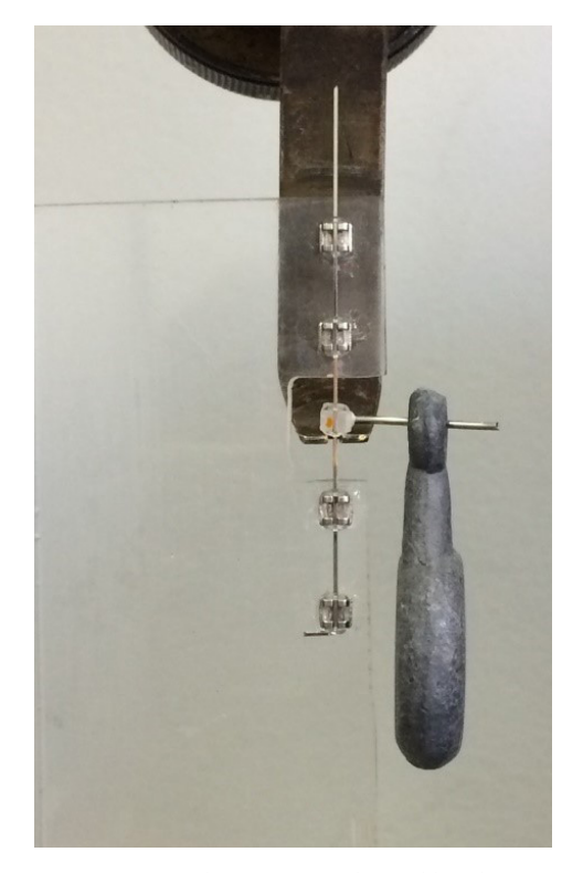
Figure 2. Friction test with conventional metal bracket.

For the friction test, an Instron universal test machine 4411 was used (Figure 2). A 50 g weight, corresponding to the mass of a mandibular incisor was used, and was supported on the sliding