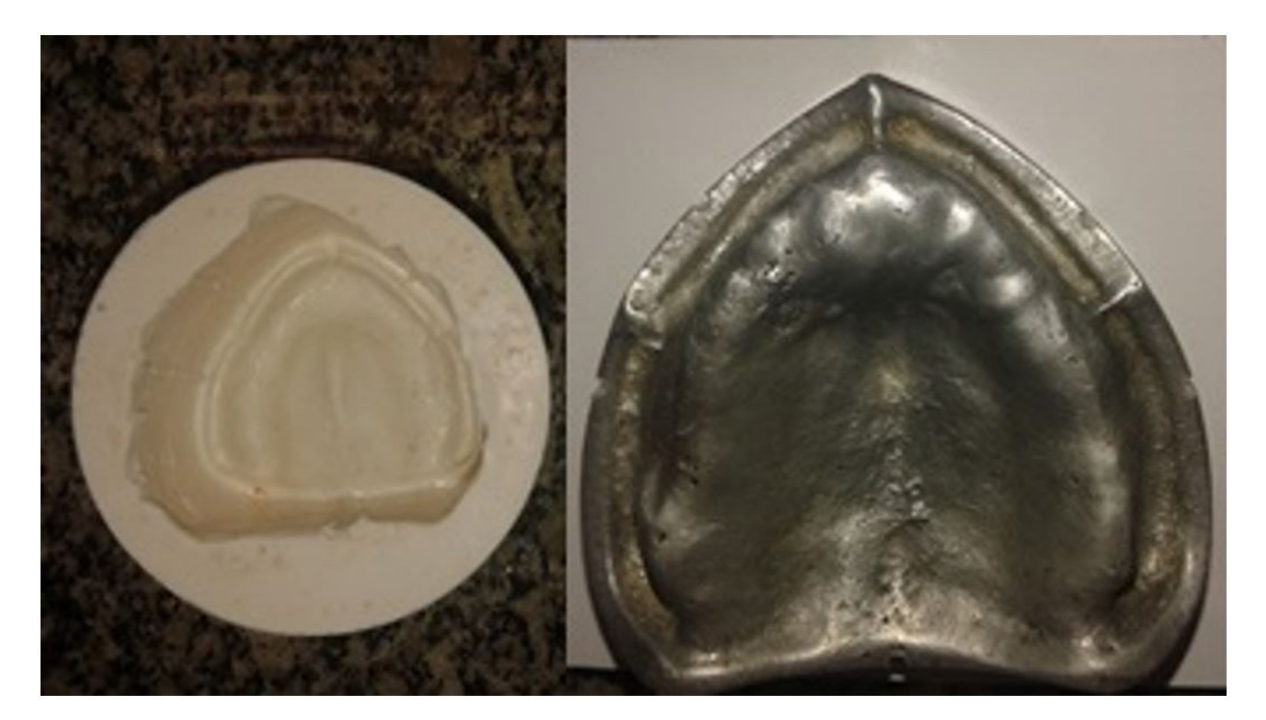
Figure 1. Silicone mold + metal model.

From it, a silicone mold was made in the laboratory<sup>12</sup> (Figure 1) that allowed the production of 10 models in type III gypsum plaster (Asfer<sup>®</sup>, São Caetano do Sul, SP, Brazil). These models were divided into 2 groups and identified according to the technique used: G1- manual adaptation of the resin to the model and G2- dripping.