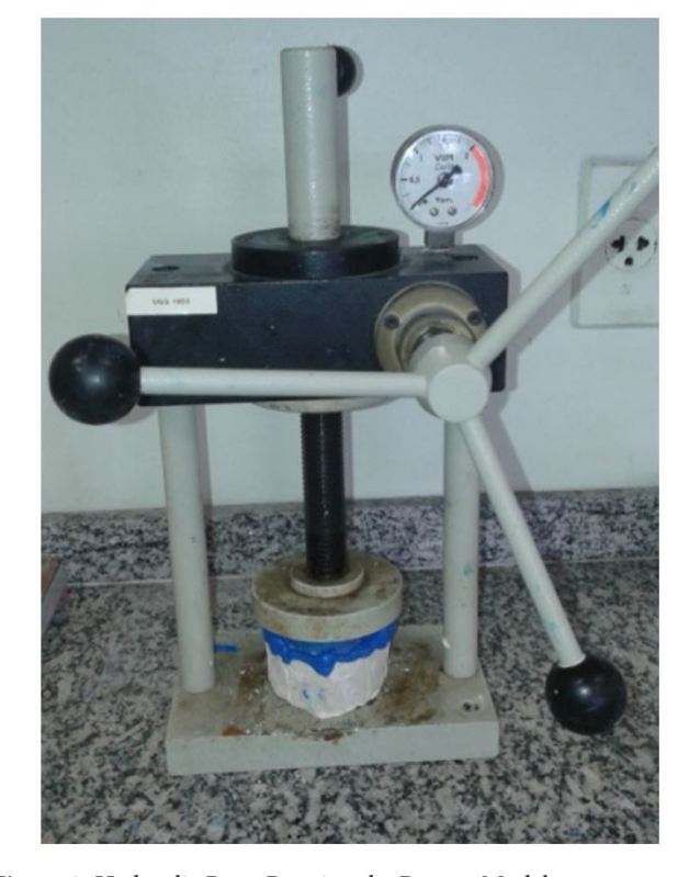
Figure 2. Hydraulic Press Pressing the Base to Model.

Table 1 shows the mean and standard deviation of general maladaptation in millimeters of the manufacturing techniques used and the regions measured. Figures 3 and 4 were obtained after